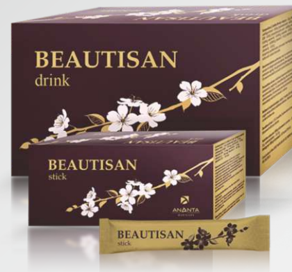
Collagen Powder Mix (Ukraine)