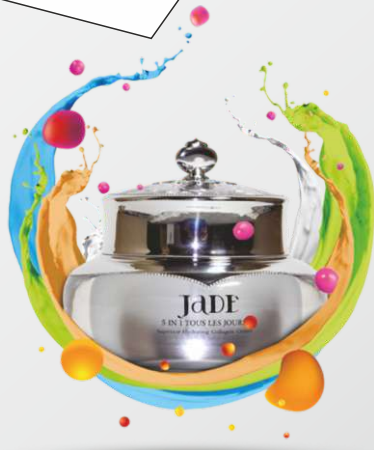
Noni Collagen Cream (USA)