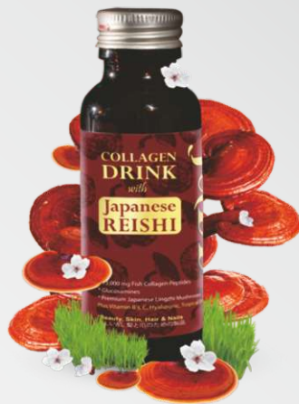
Reshi Collagen Drink (USA)