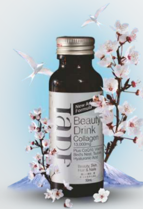
Collagen Drink (USA)